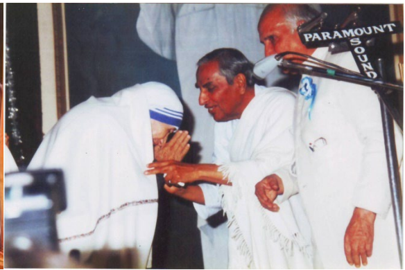
Mother Teresa Inaugurates SVM Hospital