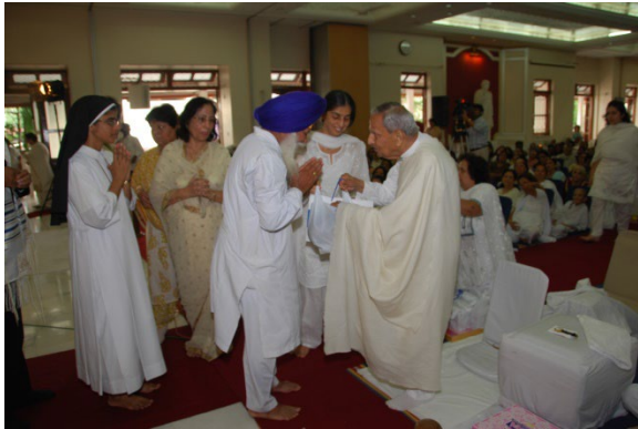
Religious Leaders Greetings on 90 th Birthday