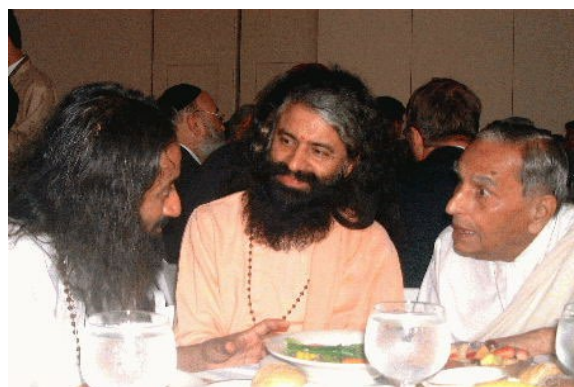
Sri Sri Ravi Shankar, Swami Chidanand Saraswati