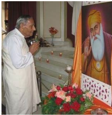
Homage to Guru Nanak