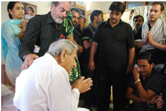
Greeting Muharram Procession at the Mission