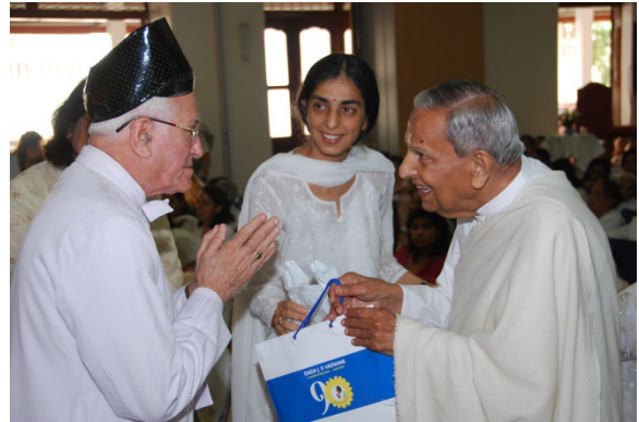
Religious Leaders Greetings on 90 th Birthday