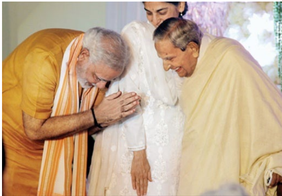
Dada with Prime Minister Narendra Modi